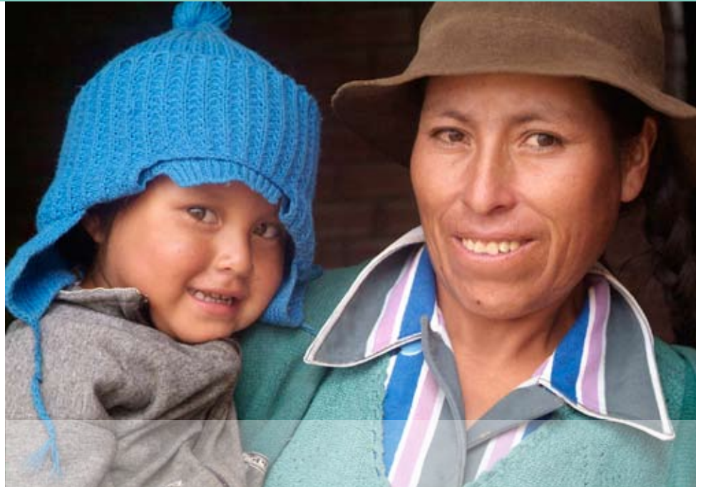
Bolivian mother and child

The evidence shows that abortion access does not reduce maternal mortality